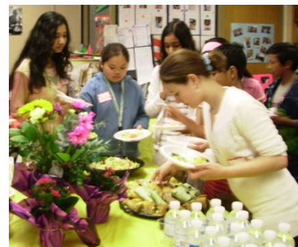
Right: A special thank you to All Star Catering for donating salads for the FEA luncheon and to Joe's No Frills, 449 Parliament St., for supplying water.