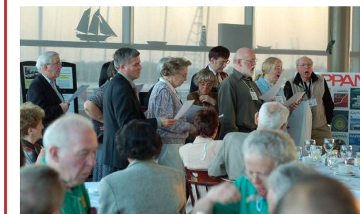
Above: The Executive sing to the tune of "As Time Goes By".