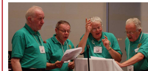
Above: Barber Shop presentations by the Scarborough Dukes of Harmony.