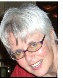
Susan Seidman Foundation

Support for the Foundation can be in any amount: even $10 dollars "counts" in the Foundation accounting. Some people send back their pledge cards; some people add an amount on when they renew their membership; others simply phone International (1-800-766-1156) and give their credit card number and amount. Please continue to show our chapter's support for Foundation.