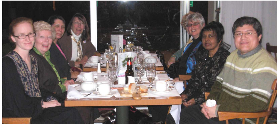
A GTA group carpoled and joined with a Niagara group where dinner conversation included learning about the history of the Niagara concerts.